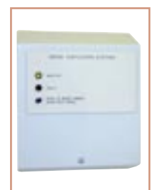
VCS Control Panel