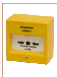
Break Glass Switch