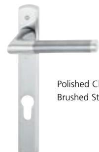
Polished Chrome/ Brushed Stainless Steel